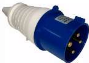
Industrial plug 16A, 32A, 63A e 125A para 110V, 220V, 380V or 440V