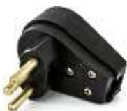
Brazilian standard 3-pin plug (10A or 20A) for 110V or 220V

We offer plug sockets according to the current and voltage specifications of the design, as well as the model that the customer needs for their process. The two product line options are: